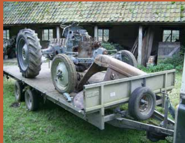
JACK, BEFORE RESTORATION

I remained in those colours until the beginning of 2018 when I changed colour from pink to orange and brown. I have just been to Woolpit Steam, my first outing in my new colours, and I was very well received.