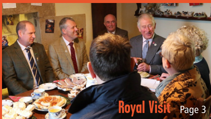
Royal Visit Page 3