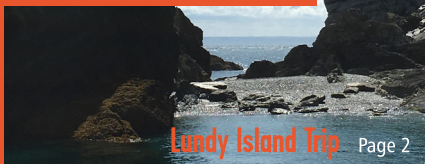
Lundy Island Trip Page 2