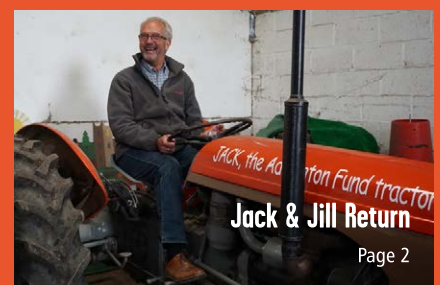
Jack & Jill Return Page 2