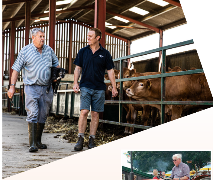
Jack and Jill, the Addington Fund Tractors, make regular appearances at Agricultural Shows and fundraising events around the country

Please detach and return to: Addington Fund, 9 Barford Exchange, Wellesbourne Road, Barford, Warwickshire, CV35 8AQ